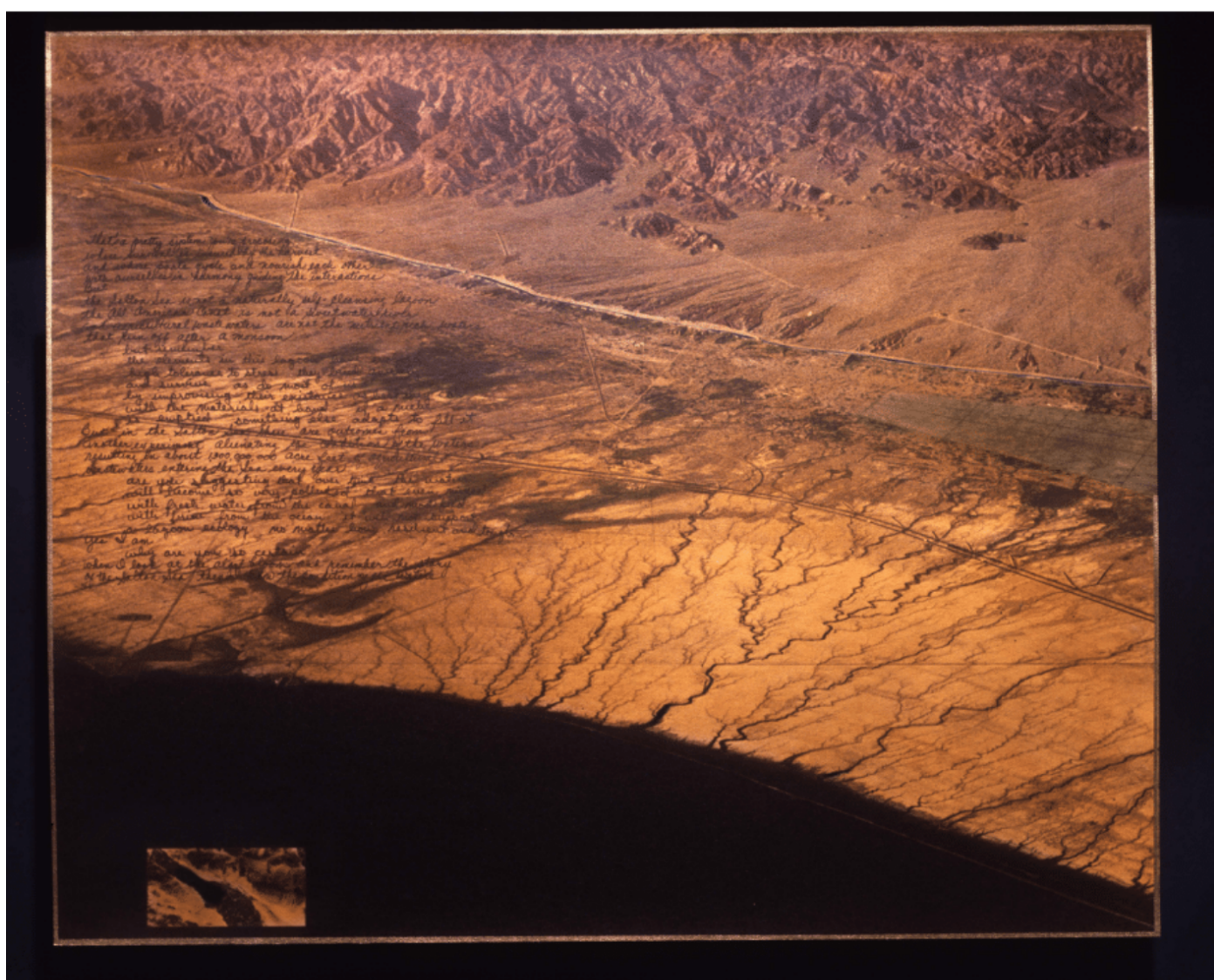
© The Book of the Lagoons by Newton Harrison and Helen Mayer Harrison

@ Salle des Conférences, MISHA, 5, allée du Général Rouvillois - Université de Strasbourg